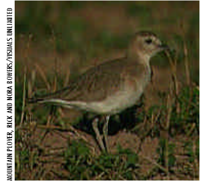
MOUNTAIN PLOVER

FWS published a mountain plover status review in 1990 concluding that the species warranted listing under the ESA. No further action was taken until 1994 when it was designated a candidate for listing. On July 7, 1997, seven years after FWS determined that the plover warranted protection under the ESA, the Biodiversity Legal Foundation petitioned FWS to list the plover as endangered or threatened. The species was proposed for listing on February