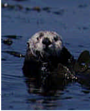
SEA OTTER, LEN RUE JR.

Steller sea lion was itself listed as an endangered species in 1990. The sea otter is a keystone species in the Bearing Sea and its decline has caused a ripple of negative effects throughout the ecosystem. Sea urchins populations have exploded as otter predation pressure has declined. Urchin predation pressure on kelp forests has conversely increased, threatening to destroy one of the basic habitats and food sources for dozens of species.