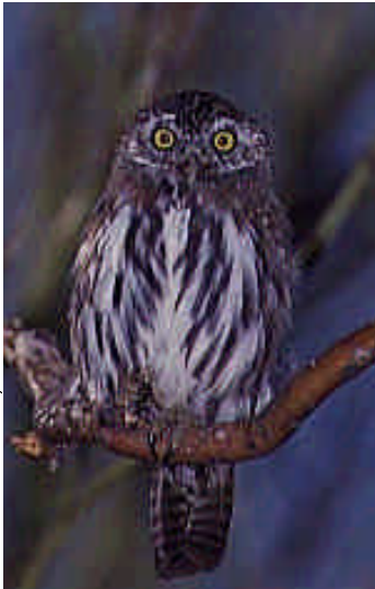
CACTUS FERRUGINOUS PYGMY OWL, BRIAN E. SHALL

district court judge ordered the U.S. Army Corps of Engineers to review the cumulative effects of all its development permits within the critical habitat zone. It was the first time the agency had been ordered to take a full accounting of the impact of urban sprawl on open space and endangered species at an ecosystem level. Pima County,