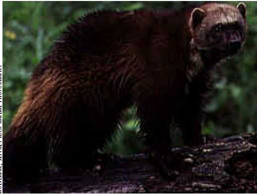
WOLVERINE

survival and recovery, including their large home range requirements, slow reproductive rate and sensitivity to human disturbance. Human activi-