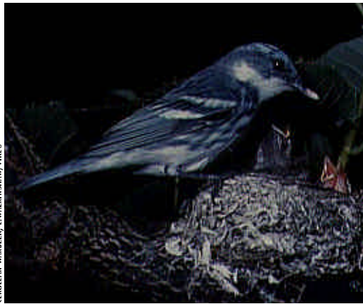
CERULEAN WARBLER

The cerulean warbler is a songbird that migrates between the eastern U.S. in the summer and the Andes Mountains in South America in the winter. Its striking blue plumage and distinctive song make it one of the most recognizable warblers. It was also one of the most abundant warblers, regularly seen throughout the U.S., especially in the Ohio and Mississippi River valleys. The species depends on large tracts of mature, native forest both in this country and in South America. However, forests in both hemispheres are being destroyed and fragmented. Seventy percent of the cerulean warbler population in the U.S. has disappeared over the last 30