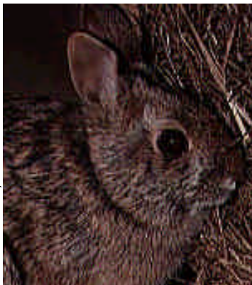
NEW ENGLAND COTTONTAIL, ROB AND ANN SIMPSON

On August 29, 2000 four organizations submitted a petition to list the New England cottontail rabbit under the ESA. Biologists estimate that over the last four decades the New England cottontail population has been declining at a rate of about 4 percent per year. There are two core factors contributing to the decline of the New England cottontail: suburban sprawl and non-native species. Dramatic human expansion in the New England area has