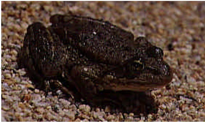
MOUNTAIN YELLOW-LEGGED FROG, STEPHEN INGRAM

Prior to the late 1960's, mountain yellow-legged frogs were abundant throughout southern California streams. Today, just 200 individuals remain in nine isolated populations within four small stream systems in the San Gabriel, San Jacinto and San Bernardino Mountains. These 200 individuals are threatened by livestock graz-